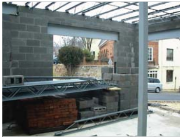
Addition to "Designs by Theresa" - Warrenton, VA

Building a strong and reliable structure requires the experience of knowledgeable engineers. DRH helps our clients by designing structures that are innovative, efficient, and that anticipate future needs and growth.