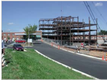
Boundary/Topo/Utility Surveys/Const. Stakeout Fauquier Hospital -- Warrenton, VA

The DRH team of surveyors has over 100 years of experience in the completion of all types of surveys. With those years comes an understanding of client needs and the importance of listening. Our surveyors know they are not simply collecting data, but that what they collect and how they collect it will have an impact on the end result and the client's bottom line.