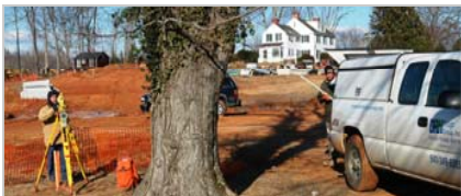
Condo & Easement Plats/Construction Stakeout Suffield Meadows— New Baltimore, Virginia

Whether handling a single lot stakeout survey or a control survey covering an extensive area, DRH seamlessly coordinates project phasing and manages costs, while providing its clients with individual attention, quality assurance and reliable results. In order to provide timely and accurate surveys our surveyor's use the latest technology including Global Positioning Surveys (GPS), electronic data collectors and total stations.