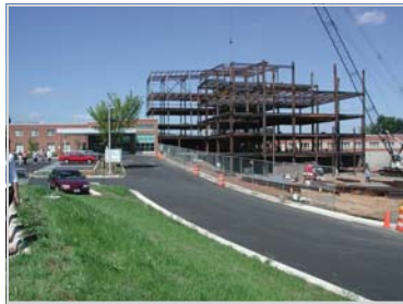
Boundary/Topo/Utility Surveys/Const. Stakeout Fauquier Hospital -- Warrenton, VA

The DRH team of surveyors has over 100 years of experience in the completion of all types of surveys. With those years comes an understanding of client needs and the importance of listening. Our surveyors know they are not simply collecting data, but that what they collect and how they collect it will have an impact on the end result and the client's bottom line.