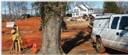
Condo & Easement Plats/Construction Stakeout Suffield Meadows— New Baltimore, Virginia

Whether handling a single lot stakeout survey or a control survey covering an extensive area, DRH seamlessly coordinates project phasing and manages costs, while providing its clients with individual attention, quality assurance and reliable results. In order to provide timely and accurate surveys our surveyor's use the latest technology including Global Positioning Surveys (GPS), electronic data collectors and total stations.